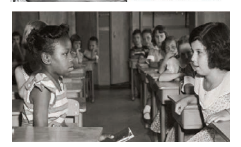
Federal court decisions ended the practice of having segregated schools for Mexican-American and African-American students.